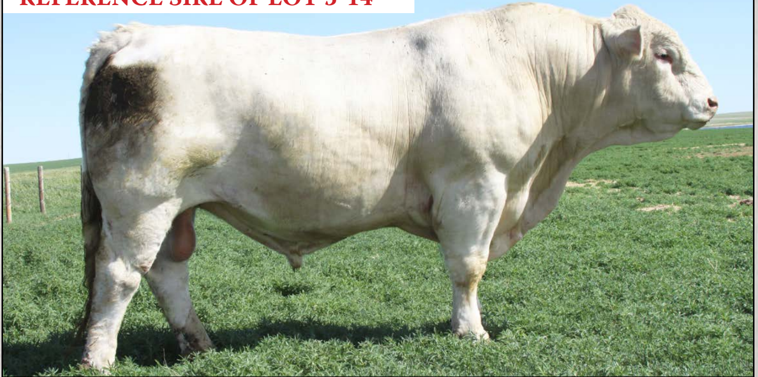
CML EXACTA 514C